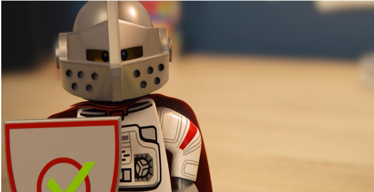
Figure 1: A still from Lego's "Captain Safety" safety policy video.

Cracknell Law's visual legals team submitted a dynamic illustrated concept, where their character's actions reflect the app's changing use of the child's own geolocation data in real-time. The benefits of such an approach were articulated by one Children's Advisory Panel member, who observed that "a cartoon can capture a scenario that people are familiar with and use that as a platform for relating the scenario to privacy". The Children's code team thought that embedding privacy information as part of the design results in a more consistent user experience. Children might engage more with privacy information that does not feel separate to the design of the service or take them away from their core activity.